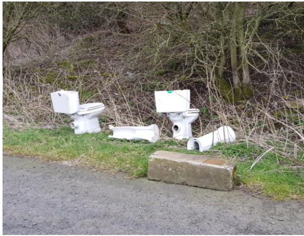
Old A1 just after clean-up

Many thanks to all the volunteers who helped with the litter-pick on Sunday 15 th March. The litter was mostly the usual mixture of drinks cans and fast-food wrappers, plus several accumulations of empty Listerine and Jack Daniels bottles, and some old tyres. Bizarrely, some toilet pans and washbasin pedestals were found dumped beside the Newton - Swarland road several days later. We just hope that the recent closure of the Alnwick Household Waste Centre does not lead to more fly-tipping in our area.